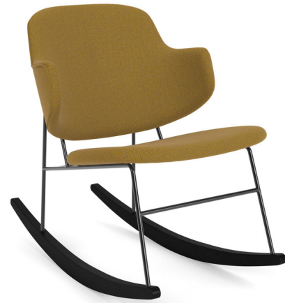
Shown in black / re-wool 448

Originally designed by Danish architect Ib Kofod-Larsen in 1953, the Penguin Rocking Chair remains popular today as an icon of Scandinavian mid-century design. Penguin is lightweight and elegant, with a gently curved upholstered back and seat crafted from plywood. The steel frame contrasts the chair's organic curves with straight lines, while the solid wood rocker legs echo the organic nature of the design.