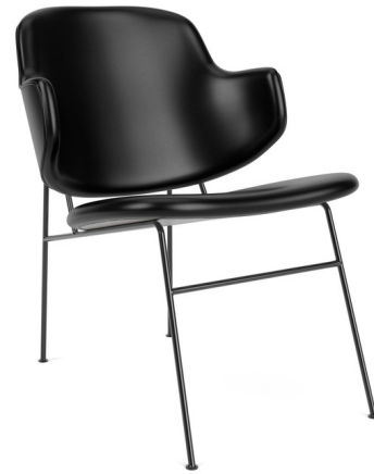
Shown in black / dakar black leather

Originally designed by Danish architect Ib Kofod-Larsen in 1953, the Penguin Lounge Chair remains popular today as an icon of Scandinavian mid-century design. Penguin is lightweight and elegant, with a gently curved upholstered back and seat crafted from plywood. The steel legs provide a stable base and contrast the chair's organic curves with straight lines.