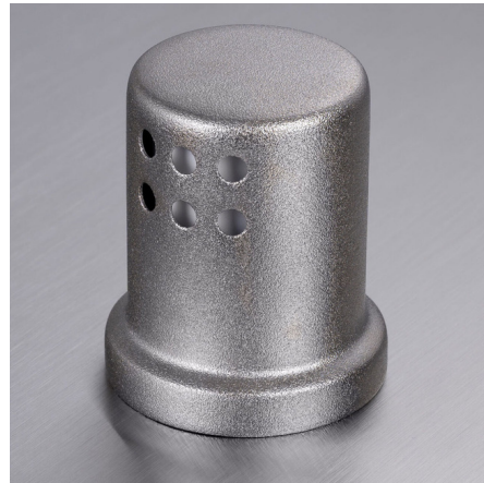
Shown in steel

The Air Gap Kit for dishwashers, complete with standard air gap fitting and solid metal cover (slides on over assembly). Features flood level marking. Use it to prevent accidental backflow water contamination. Designed to complement Buster + Punch mixer faucets.