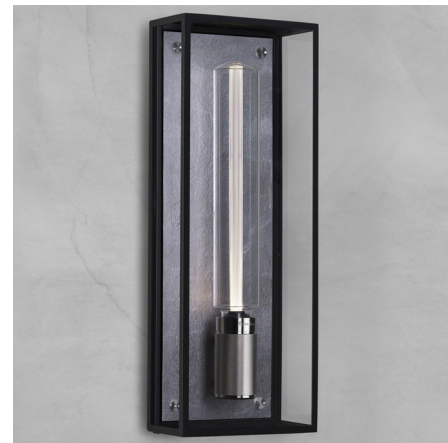
Shown in steel / clear

The Caged Wet Wall Light is a versatile fixture with a transitional design, featuring a rectangular metal and glass cage surrounding the light source. The glass panes protect the fixture from water, making it suitable for use outdoors or in bathrooms. The sconce's socket is decorated with a cross knurled pattern and Buster + Punch's signature coin screws are left exposed for a modern industrial look.