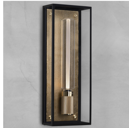
Shown in brass / clear

The Caged Wet Wall Light is a versatile fixture with a transitional design, featuring a rectangular metal and glass cage surrounding the light source. The glass panes protect the fixture from water, making it suitable for use outdoors or in bathrooms. The sconce's socket is decorated with a cross knurled pattern and Buster + Punch's signature coin screws are left exposed for a modern industrial look.