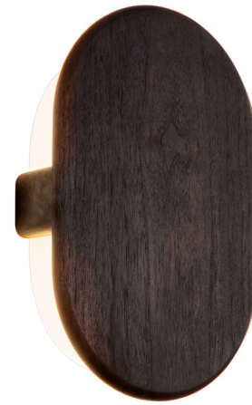
Shown in dark stained walnut / frosted polymer

The Tempus Wall Sconce honors the beauty of nature, showcasing a solid wood body that highlights the elegance of wood grain. Its rounded profile, rounded edges, and ample yet smooth diffused light exude warmth. The fixture glows bright from behind the wood as LED light passes through the frosted polymer diffuser. The versatile design works well with any room style from traditional to sleek and modern. 120V: TRIAC, ELV, and 0-10V dimmable. 240 and 277V: 0-10V dimmable.