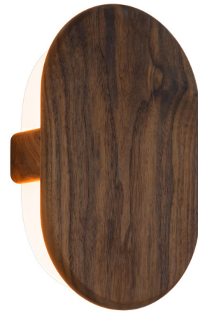
Shown in walnut / frosted polymer

The Tempus Wall Sconce honors the beauty of nature, showcasing a solid wood body that highlights the elegance of wood grain. Its rounded profile, rounded edges, and ample yet smooth diffused light exude warmth. The fixture glows bright from behind the wood as LED light passes through the frosted polymer diffuser. The versatile design works well with any room style from traditional to sleek and modern. 120V: TRIAC, ELV, and 0-10V dimmable. 240 and 277V: 0-10V dimmable.