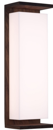
Shown in dark stained walnut / frosted

COLOR RENDERING 90 CRI LAMP COLOR 3000K LUMENS/WATT 73.95 LUMINOUS FLUX 1124 lumens