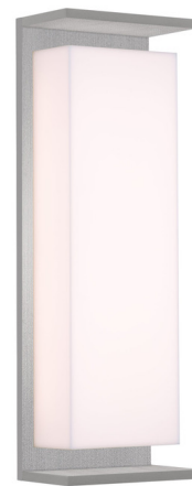
Shown in brushed aluminum / frosted

COLOR RENDERING . . . . . 90 CRI LAMP COLOR . . . . . 3000K LUMENS/WATT . . . . . 73.95 LUMINOUS FLUX . . . . . 1124 lumens