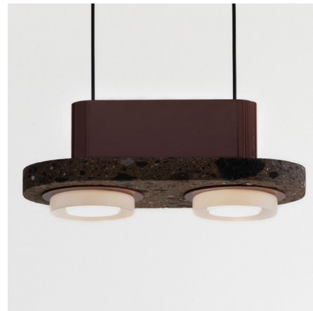
Shown in red / cantera cafe stone

The Ambra Double Pendant's timeless geometrical form speaks to us about architecture. Full of character and strong lines, it is simply shaped and elegant. The proportions play with gravity, overlapping both materials. It becomes the center of attention with its warm and vibrant light. The unquestionable rich aesthetic of powder coated aluminum and stunning volcanic rock texture becomes a sculpture of light.