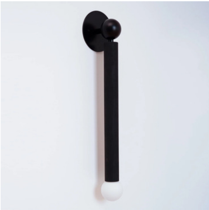
Shown in: Black Oak / Black

The Constellation Hanging Wall Sconce is inspired by the stars of the night sky. The metal sphere of the backplate has a cylindrical wood branch that is capped by a single glass orb that casts a warm glow of light across your room.