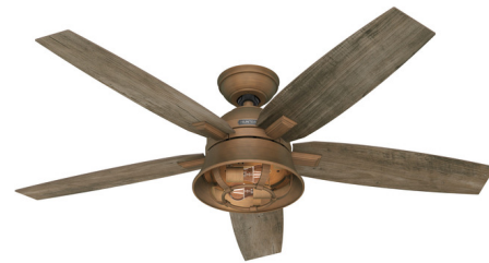
Shown in weathered copper / grey pine

The Hampshire Ceiling Fan offers rustic charm with its bell-shaped motor housing and wood-patterned blades. Equipped with a 3-speed WhisperWind motor backed by the SureSpeed Guarantee, it quietly delivers fast airflow to provide comfort in your space. A light kit with two LED bulbs provides energy-efficient ambient illumination. A handheld remote control with wall cradle is included, and enables fan on/off, speed adjustment, light on/off, and dimming. Fan direction can be reversed using a switch on the fan. Optional accessories are sold separately.