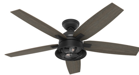
Shown in matte black / greyed walnut

The Hampshire Ceiling Fan offers rustic charm with its bell-shaped motor housing and wood-patterned blades. Equipped with a 3-speed WhisperWind motor backed by the SureSpeed Guarantee, it quietly delivers fast airflow to provide comfort in your space. A light kit with two LED bulbs provides energy-efficient ambient illumination. A handheld remote control with wall cradle is included, and enables fan on/off, speed adjustment, light on/off, and dimming. Fan direction can be reversed using a switch on the fan. Optional accessories are sold separately.