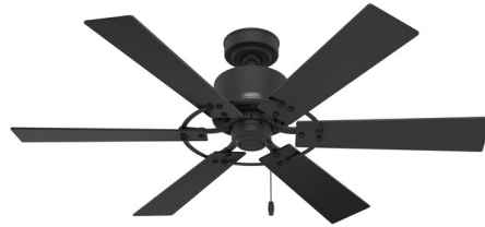
Shown in matte black / golden maple / matte black