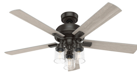
Shown in noble bronze / light gray oak

LAMP LIFE . . . . . 15000 hours COLOR RENDERING . . . . . 80 CRI LAMP COLOR . . . . . 2700K LUMENS/WATT . . . . . 300.00 LUMINOUS FLUX . . . . . 1050 lumens