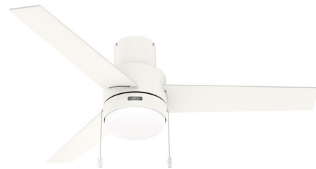
Shown in matte white / fresh white / light oak

LAMP LIFE . . . . . 25000 hours COLOR RENDERING . . . . . 80 CRI LAMP COLOR . . . . . 3000K LUMENS/WATT . . . . . 177.78 LUMINOUS FLUX . . . . . 1600 lumens