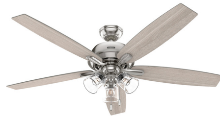
Shown in brushed nickel / light gray oak