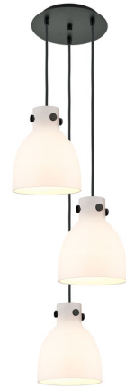
Shown in matte black / frosted