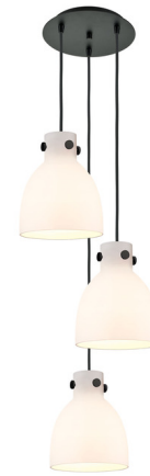
Shown in matte black / frosted