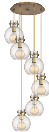
Shown in brushed brass / clear seedy