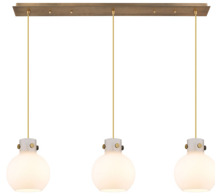
Shown in brushed brass / frosted