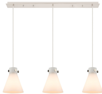
Shown in polished nickel / frosted

The Newton Cone Linear Multi Light Pendant is suitable for traditional, industrial and modern spaces alike with its row of conical glass shades suspended from a rectangular canopy. Each pendant includes 120 inches of fabric cable which can be cut to length onsite to create unique arrangements. Note: Due to the weight of the fixture, the 7-Light pendant requires additional ceiling support.