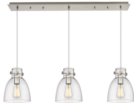
Shown in brushed satin nickel / clear seedy

The Newton Bell Linear Multi Light Pendant is suitable for traditional, industrial and modern spaces alike with its row of bell-shaped glass shades suspended from a rectangular canopy. Each pendant includes 120 inches of fabric cable which can be cut to length onsite to create unique arrangements. Note: Due to the weight of the fixture, the 7-Light pendant requires additional ceiling support.