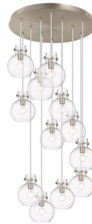
Shown in brushed satin nickel / clear

The Newton Sphere Multi Light Pendant is suitable for traditional, industrial and modern spaces alike with its grouping of globe-shaped glass shades suspended from a round canopy. Each pendant includes 120 inches of fabric cable which can be cut to length onsite to create unique arrangements. Note: Due to the weight of the fixtures, the 9-Light and 12-Light pendants require additional ceiling support.