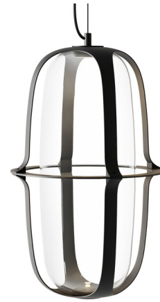
Shown in matte black / clear

COLOR RENDERING . . . . . 90 CRI LAMP COLOR . . . . . 2700K LUMENS/WATT . . . . . 110.00 LUMINOUS FLUX . . . . . 2750 lumens