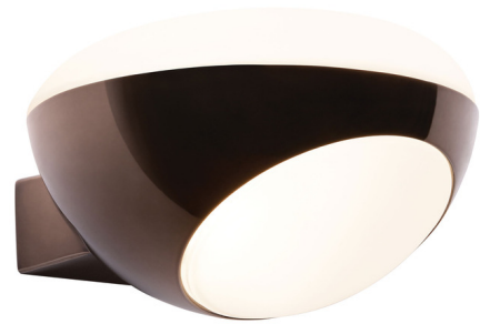
Shown in black tin / acid etched glass

The Tua Wall Light offers an elegant blend of retro and modern influences in a carefully balanced contrast. The bottom portion of the sconce is globe shaped, a nod to mid-century modernism, while oblique cutouts for the acid etched glass diffuser introduce a more contemporary element. Includes circular wall plate to cover standard 4 inch junction box.