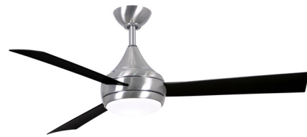
Shown in brushed stainless steel / matte black

LAMP LIFE . . . . . 60000 hours COLOR RENDERING . . . . . 90 CRI LAMP COLOR . . . . . 3017K LUMENS/WATT . . . . . 45.31 LUMINOUS FLUX . . . . . 725 lumens