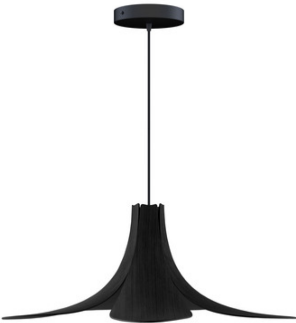
Shown in: Black / Black Oak

The Jazz Pendant, designed in Denmark by Magnus Nero and Ingemar Jonsson, is inspired by the flowing lines of the frangipani flower and the classic gramophone horn. Crafted from veneer, this piece is perfect in a variety of interior spaces. Plug in option includes shade, socket assembly, 10 foot cord and plug.