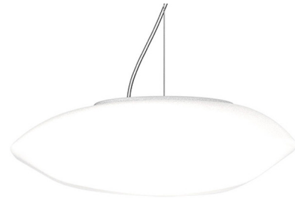
Shown in matte white / matte white

The Modulor LED Pendant features a beveled glass shade. The beauty of the shade's blown glass material is highlighted by its simple geometric form. The shade houses an integrated LED light source to provide softly diffused ambient lighting.