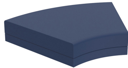
Shown in matte notte blue

The Pixel Curved Modular Ottoman is a versatile indoor / outdoor sectional piece with a minimalist modern expression. This module is designed to be combined with other pieces from Vondom's Pixel modular collection with its curved shape allowing for the creation of unique seating configurations to suit any space. Pixel is constructed from a polyethylene resin base and topped with a cushion upholstered in acrylic fabric making it suited for both indoor and outdoor use.