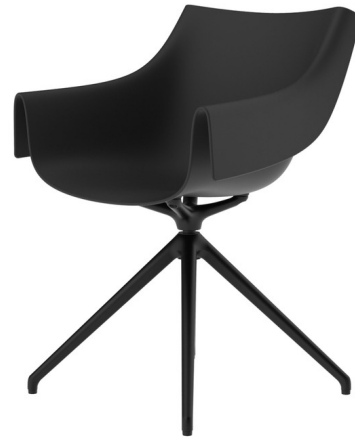
Shown in black / black

The Manta Swivel Armchair is a versatile piece suitable for a wide range of environments from private residences to offices to indoor public spaces. The sling-shaped seat is crafted from rigid and durable polypropylene and fiber glass and supported by an aluminum swivel base. Includes a set of 2 chairs.