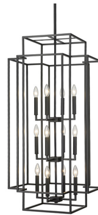
Shown in matte black

PRODUCT DIMENSIONS . . . . . Downrods Included: 1-3", 1-6", and 3-12" Stems