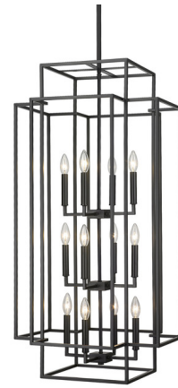
Shown in matte black

PRODUCT DIMENSIONS . . . . . Downrods Included: 1-3", 1-6", and 3-12" Stems