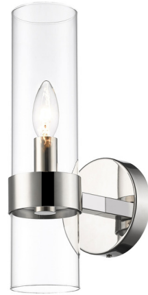
Shown in polished nickel / clear

A classic and elegant metal frame offers a hint of drama to this distinctive Datus one-light wall sconce. Contemporary vibes infuse an easy-living attitude with prominence in a sleek design featuring a slender clear glass cylinder shade mounted to a sophisticated finish solid steel frame and mount. Bring ambient lighting to a hallway, bath space, or main living area with this sconce with a minimalist yet impressionable flavor.