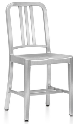
Shown in hand brushed aluminum

The original. The 1006 Navy Collection Chair was originally created in 1944 for the US Navy as a lightweight, non-corrosive, fire resistant and super strong chair for ships and submarines. Still built by hand from recycled aluminum in Hanover, Pennsylvania. Guaranteed for life. Note: The Hand Brushed option is suitable for outdoor use.