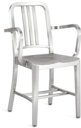
Shown in hand brushed aluminum

The original. The 1006 Navy Collection Chair was originally created in 1944 for the US Navy as a lightweight, non-corrosive, fire resistant and super strong chair for ships and submarines. Still built by hand from recycled aluminum in Hanover, Pennsylvania. Guaranteed for life. Note: The Hand Brushed option is suitable for outdoor use.