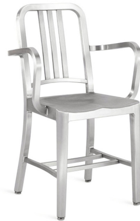
Shown in hand brushed aluminum

The original. The 1006 Navy Collection Chair was originally created in 1944 for the US Navy as a lightweight, non-corrosive, fire resistant and super strong chair for ships and submarines. Still built by hand from recycled aluminum in Hanover, Pennsylvania. Guaranteed for life. Note: The Hand Brushed option is suitable for outdoor use.