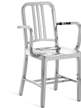
Shown in hand polished aluminum

The original. The 1006 Navy Collection Chair was originally created in 1944 for the US Navy as a lightweight, non-corrosive, fire resistant and super strong chair for ships and submarines. Still built by hand from recycled aluminum in Hanover, Pennsylvania. Guaranteed for life. Note: The Hand Brushed option is suitable for outdoor use.