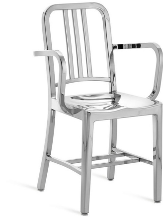
Shown in hand polished aluminum

The original. The 1006 Navy Collection Chair was originally created in 1944 for the US Navy as a lightweight, non-corrosive, fire resistant and super strong chair for ships and submarines. Still built by hand from recycled aluminum in Hanover, Pennsylvania. Guaranteed for life. Note: The Hand Brushed option is suitable for outdoor use.