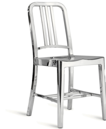
Shown in hand polished aluminum

The original. The 1006 Navy Collection Chair was originally created in 1944 for the US Navy as a lightweight, non-corrosive, fire resistant and super strong chair for ships and submarines. Still built by hand from recycled aluminum in Hanover, Pennsylvania. Guaranteed for life. Note: The Hand Brushed option is suitable for outdoor use.