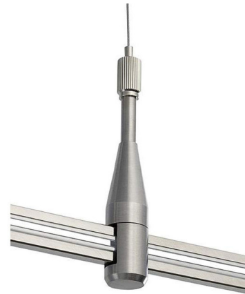
Shown in satin nickel

The Monorail Adjustable Standoff is designed for use with the Tech Lighting Monorail system. Its thin cable virtually disappears for a clean, elegant look. It is best for fairly straight runs with a drop greater than 6 inches. A wire grip allows you to easily shorten or lengthen the cable to size it for use. Use standoff supports at every 3 ft of Monorail run and at corners. Standoffs can be positioned to cover points where rails are joined. For the best look, place the last standoff 4-6 inches from the end of the rail and place standoffs symmetrically. Note: The Aged Brass finish is only available for the 144 inch height.