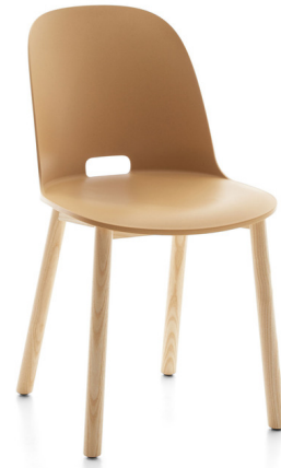
Shown in natural ash / sand polypropylene

The Alfi Chair is a family of chairs with seats made from 100% reclaimed materials, combined with a base in sustainably sourced solid ash. The seat is made of reclaimed polypropylene mixed with wood fiber. The wood particles create a speckled texture that gives the surface a warmer, more natural touch. Engineered for comfort and strength. Made in the USA. Alfi Slip Cover available, sold separately.