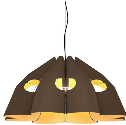
Shown in black / ebony / ash

The Victoria Pendant is designed, handcrafted in Argentina and assembled in the USA. A two-sided wood veneer section is fused with a malleable center panel for strength and flexibility to create a work of art. Due to hand-crafted nature, colors vary from fixture to fixture. Bruck's WEP (Wood Ecological Project) collection specializes in sustainable, natural wood luminaires. Every made to order fixture's unique character is nothing short of art. WEPlight solutions help cultivate a serene environment in any space. Designed, handcrafted, and painted by master artisans with reconstructed real wood veneer from Spain and assembled in the USA.