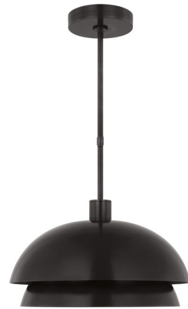
Shown in dark bronze

The Shanti Pendant features layered spun metal bowls that form a distinctive modern profile inspired by industrial style. The layered shades come to life as LED light highlights the structure while creating a warm, radiant glow. TRIAC, ELV, or 0-10V dimmable. The 31.5 inch diameter pendant is Title 24 compliant, and the 20.5 inch and 26 inch pendants are not. Note: The 31.5 inch diameter pendant in Dark Bronze or Natural Brass requires a junction box rated for fixtures weighing over 50 lb.