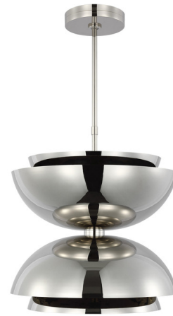
Shown in polished nickel

Inspired by the clean lines of industrial style, the Shanti Double Pendant features layered spun metal bowls that come to life as LED light shines upward and downward. This distinctive, modern pendant brings a warm, radiant glow to a foyer, kitchen, or dining room. TRIAC, ELV, or 0-10V dimmable. The 31.5 inch diameter pendant is Title 24 compliant, and the 20.5 inch and 26 inch pendants are not. Note: The 31.5 inch diameter pendant requires a junction rated for fixtures weighing over 50 lb.