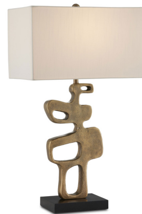
Shown in antique brass / black / off white

PRODUCT DIMENSIONS . . . . . Shade Dimensions: 10" x 17" x 10"