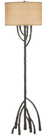
Shown in bronze / grasscloth

PRODUCT DIMENSIONS . . . . . Shade Dimensions: 11.5" x 20" x 20"