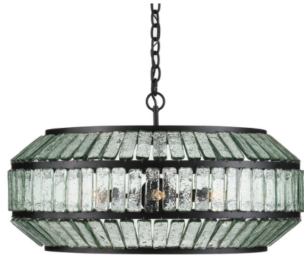
Shown in satin black / clear