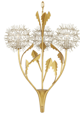
Shown in contemporary gold & silver leaf

PRODUCT DIMENSIONS . . . . . Adjustable Height: 35.25" to 103.25"