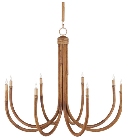
Shown in tan

PRODUCT DIMENSIONS . . . . . Downrod Lengths: (6) 12" included.