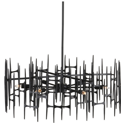
Shown in satin black

PRODUCT DIMENSIONS . . . . . Downrod Lengths: 6, (3) 12" included.