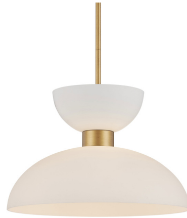
Shown in antique brass / white

PRODUCT DIMENSIONS . . . . . Downrods Included: 6,12,12,12".