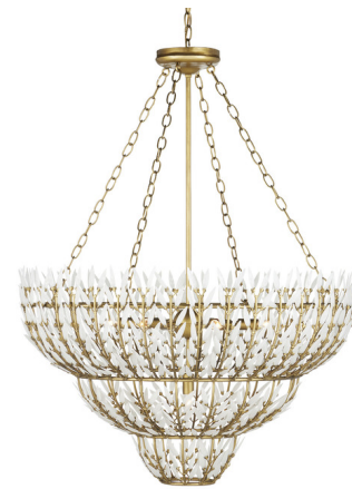
Shown in brass / white

PRODUCT DIMENSIONS . . . . . Adjustable Height: 48.5" to 116.5"