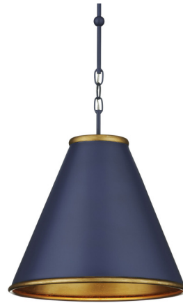
Shown in dark blue / dark blue / gold

The Pierrepont Pendant is made of wrought iron with a Hiroshi dark blue finish on its exterior and a contemporary gold leaf finish on the interior of its shade. The rolled edges of the rings connecting them, at the top and bottom of the pendant, gleam in a gold finish and are sophisticated details that bring an uptick in style to this handsome fixture. When simplicity is the aim, the Pierrepont will fit right in given the clean lines of the fixture's profile and its hanging hardware.